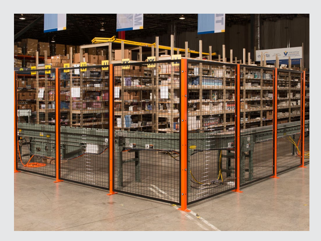
Boasting an unrivaled heavy duty wire mesh.