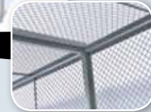
WOVEN WIRE MESH