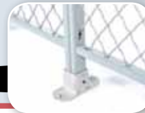
BASE SHOE FLOOR CONNECTION