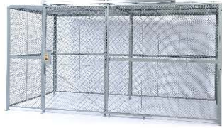
SpaceGuard 2000 Versatile Mesh Enclosures