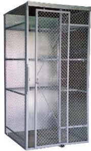
Military Readiness Storage Lockers