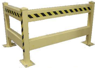
AisleGuard Physical Barriers & Bollards