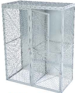
Wire Mesh Storage Lockers