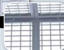
WELDED WIRE MESH