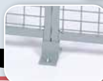
BASE SHOE FLOOR CONNECTION